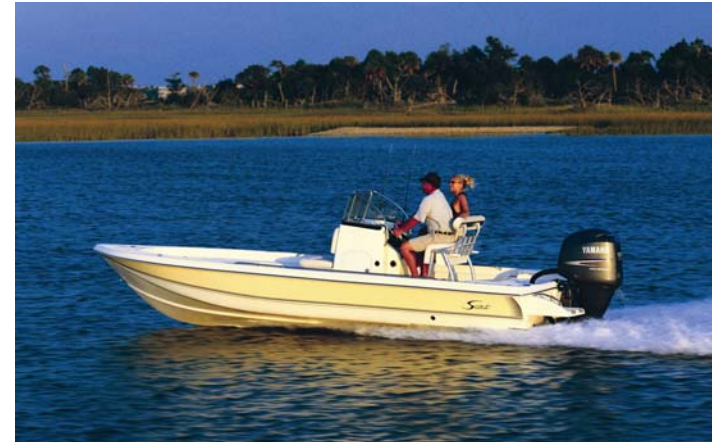
220 Bay Scout Powered by a Yamaha 150 4 stroke and available with a Magic Tilt Aluminum Trailer