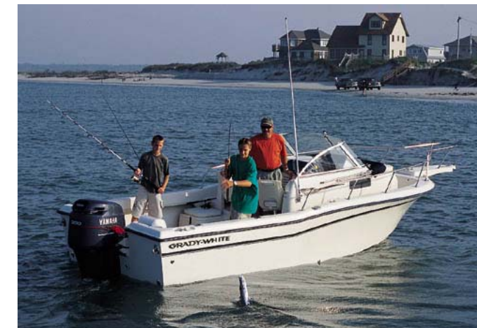
208 Adventure Powered by a Yamaha 225 4 stroke and available with a Magic Tilt Aluminum Trailer

NOTE: OUR AGREEMENTS WITH SCOUT AND GRADY WON'T LET US PUT OUR LOW PRICES IN THIS NEWSLETTER BECAUSE OF ITS WIDE DISTRIBUTION. CALL, PLEASE! IT WILL BE WORTH YOUR TIME. 800-365-1504