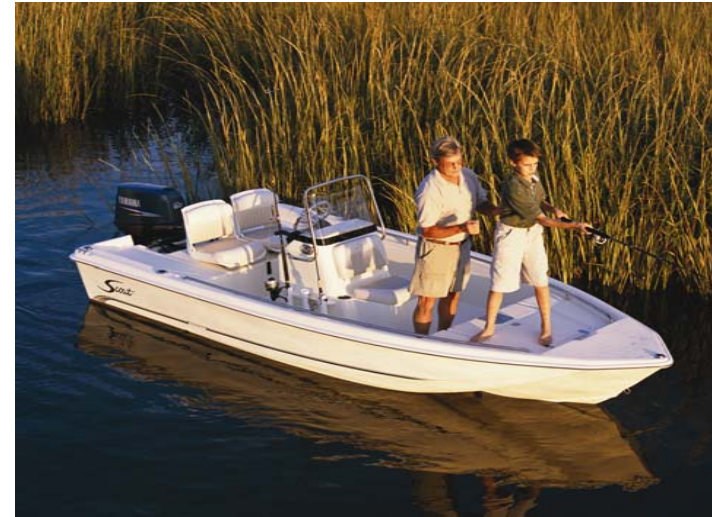
160 Sportfish Powered by a Yamaha 60 and available with a Magic Tilt Aluminum Trailer